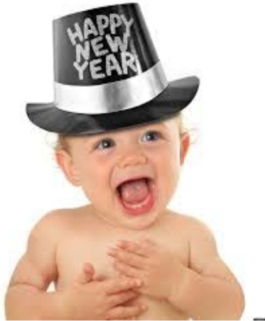
January 1, 2018