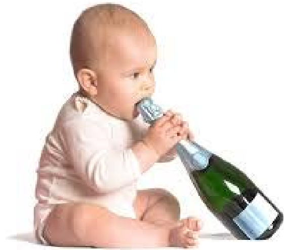
January 2, 2018